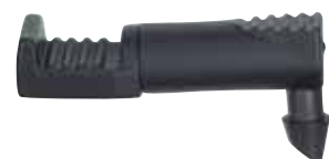
Midi Drip™ Barb 4 mm