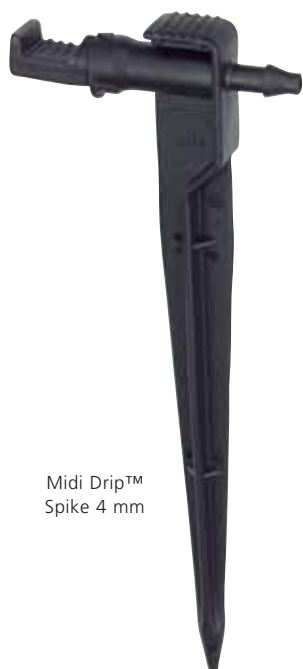
Midi Drip™ Spike 4 mm

Shrubs and flowers, fruit trees, vines and tomatoes in a wide range of situations from home gardens to large scale nurseries.